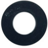
ARANDELA D12,5 PC0578