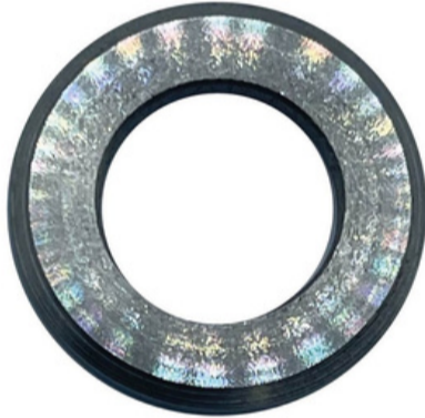
ARANDELA D12,5 PC32595